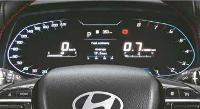
Digital cluster with TFT multi information display

Other features: Perforated leather wrapped gear knob with N logo | Sliding front armrest | Sporty metal pedals Dark metal finish inside door handles | Fast USB charger (Type C)