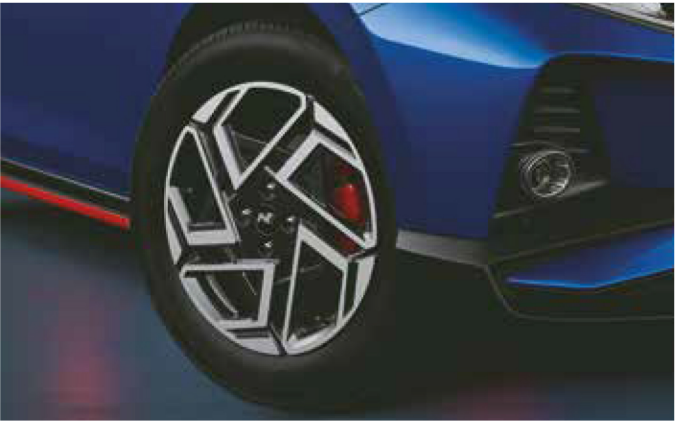
Front and rear disc brakes