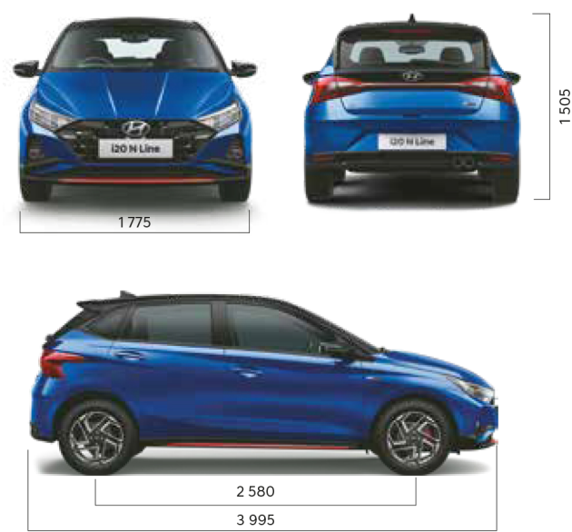
Dimensions unit : mm