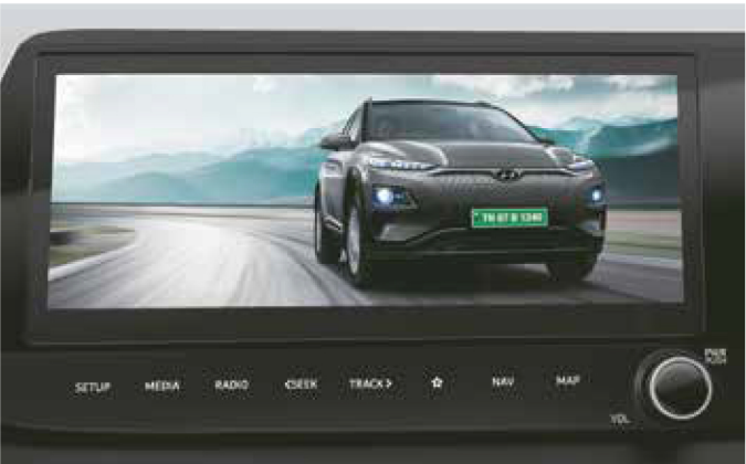
Driver rear view monitor system

Other features: ISOFIX | Emergency stop signal (ESS) | Rear parking sensors