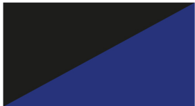
Thunder blue with abyss black roof