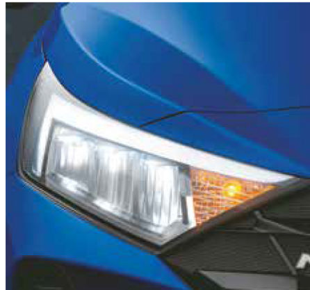
LED headlamps with signature LED DRLs