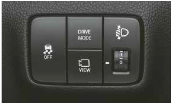
Drive mode select