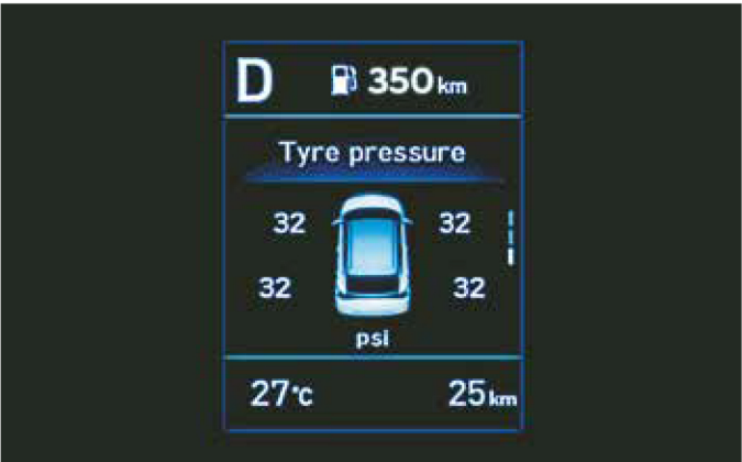
Tyre pressure monitoring system (highline)