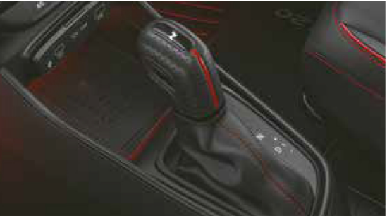
7 speed DCT (Dual clutch transmission)