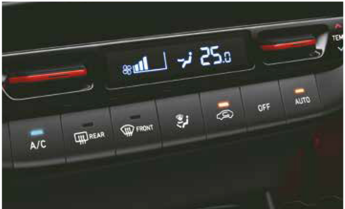
FATEC with digital display

Other features: Smart entry with push button start/stop