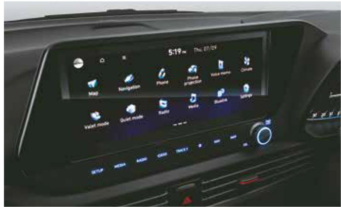
26.03 cm (10.25 inch) HD touchscreen infotainment & navigation system