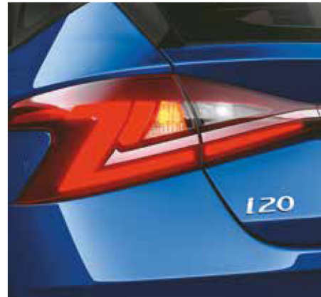
Z-shaped LED tail lamps