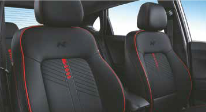
Chequered flag design leather seats with N logo