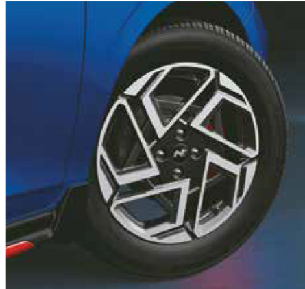
R16 (D=405.6 mm) Diamond cut alloy wheels