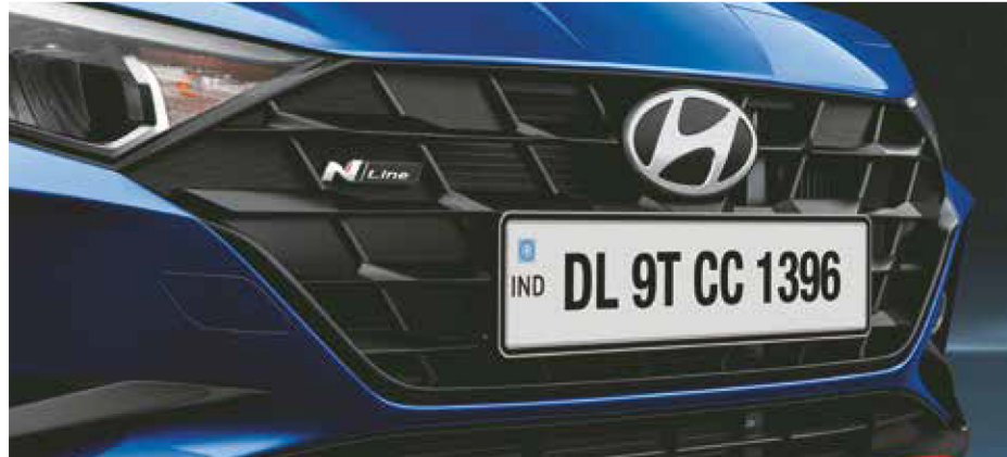
Sporty black radiator grille

Athletically aesthetic, the new Hyundai i20 N Line is built to command attention, all the way from the subtle chrome garnish on the foglamps to the tailgate spoiler with side wings. The sporty red highlights accentuate the performance inspired design, ensuring that all eyes are always on you.