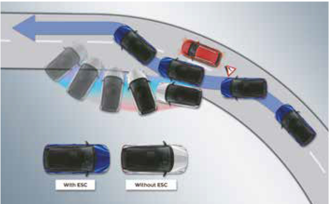
Electronic stability control (ESC) & Vehicle stability management (VSM)