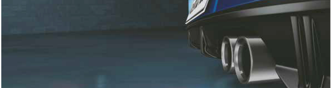
Sporty twin tip muffler

1.0 I Turbo GDi petrol engine 88.3 Maximum power kW (120 PS) @ 6 000 r/min