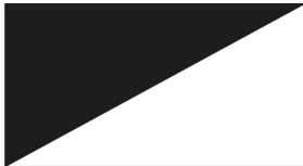
Atlas white with abyss black roof