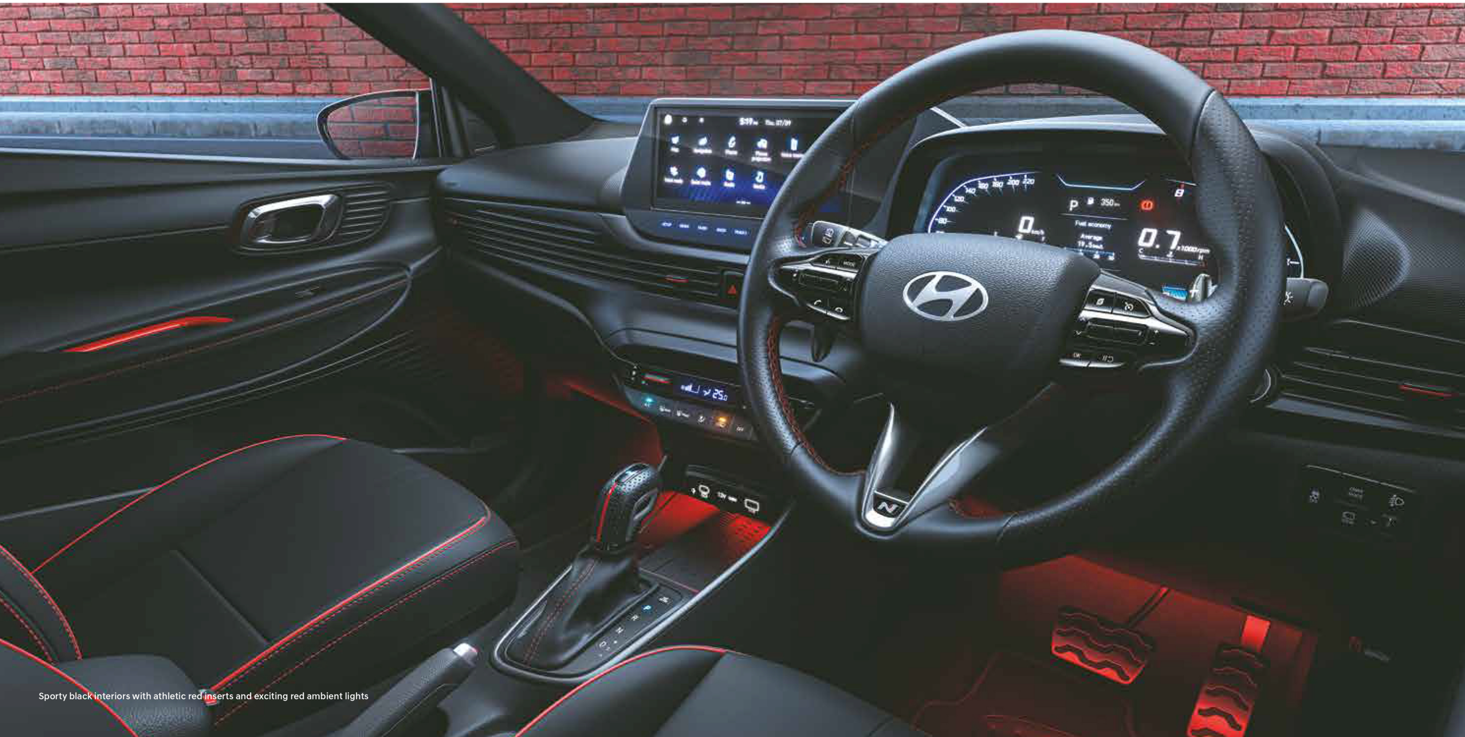
Sporty black interiors with athletic red inserts and exciting red ambient lights