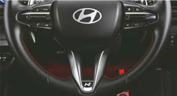
3-spoke steering wheel with N logo