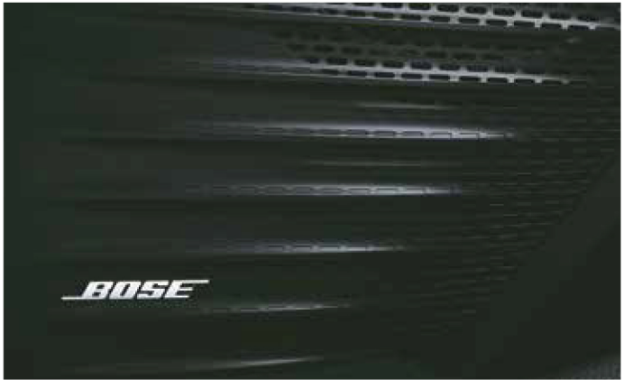
Bose premium 7 speaker system