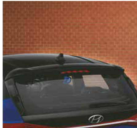
Sporty tailgate spoiler with side wings

Other features: Athletic red highlights (front skid plate & side sill garnish) | Front fog lamp chrome garnish