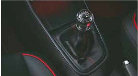
6-speed MT (Manual transmission)